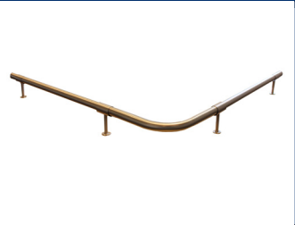
CART BUMPER RAILS