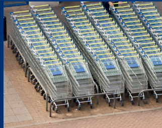
CART CORRAL RAILS