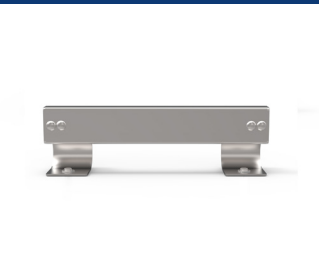
CART CRASH RAILS

FenWall is a national specialty manufacturer and supplier of architectural metal systems, specializing in the following products: