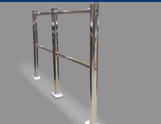
TRAFFIC CONTROL RAILS