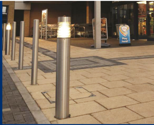
EXTERIOR BOLLARDS AND COVERS